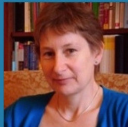
NO TRUST, NO FORGIVENESS, AND NO LINES IN THE SAND: A COUNTER-INTUITIVE TAKE ON WORKING WITH COUPLES IN CRISIS - GAYNOR BOILEAU